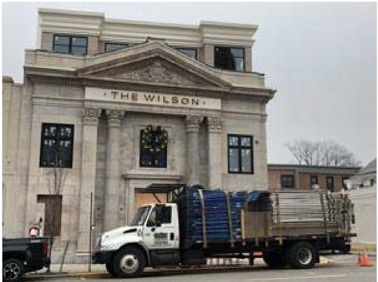
Renovated Caldwell office building, The Wilson, to open March 1